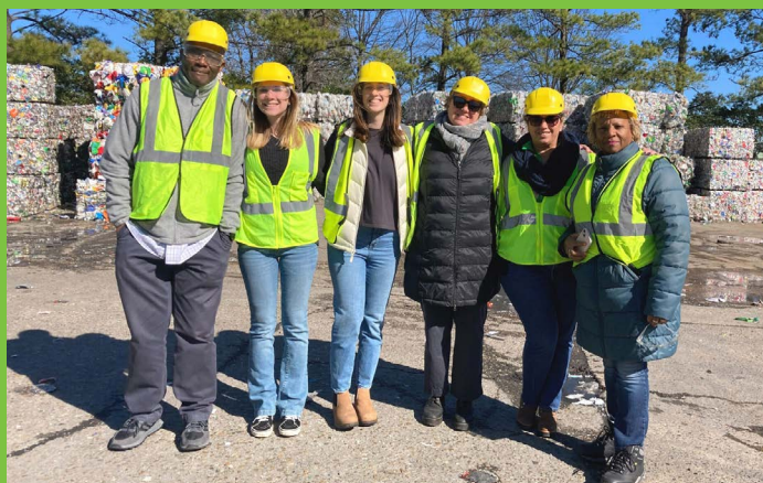
Public Works, works! Norfolk Public Works toured the Materials Recovery Facility.