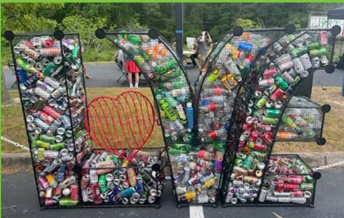
VA is for Recycling LOVERS! "Love" installation made from recycled materials, sponsored by TFC