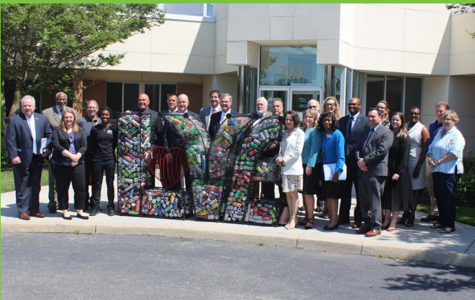
TFC Recycling and Ask HRGreen teaming up to present the new, sustainable VA is for Lovers LOVE sign.