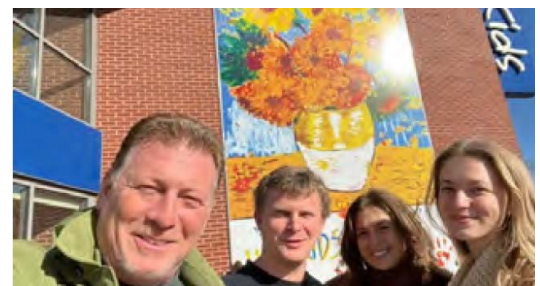
The Benedetto Family supporting ForKids in Chesapeake, helping to deliver holiday meals.