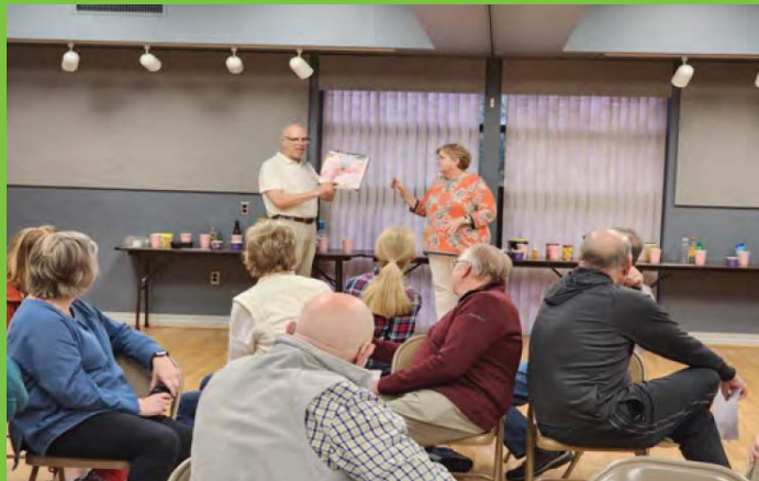
THIS OR THAT? King's Grant Civic League mastered how to recycle right after a workshop with TFC