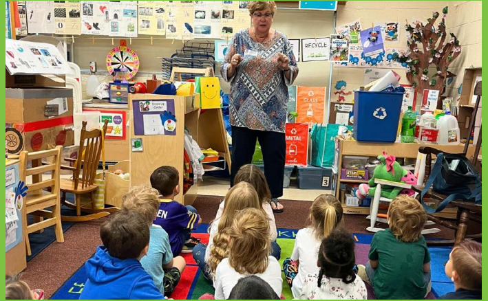
What's in Your Bin?! TFC educating students at Tarralton Elementary on how to recycle right.