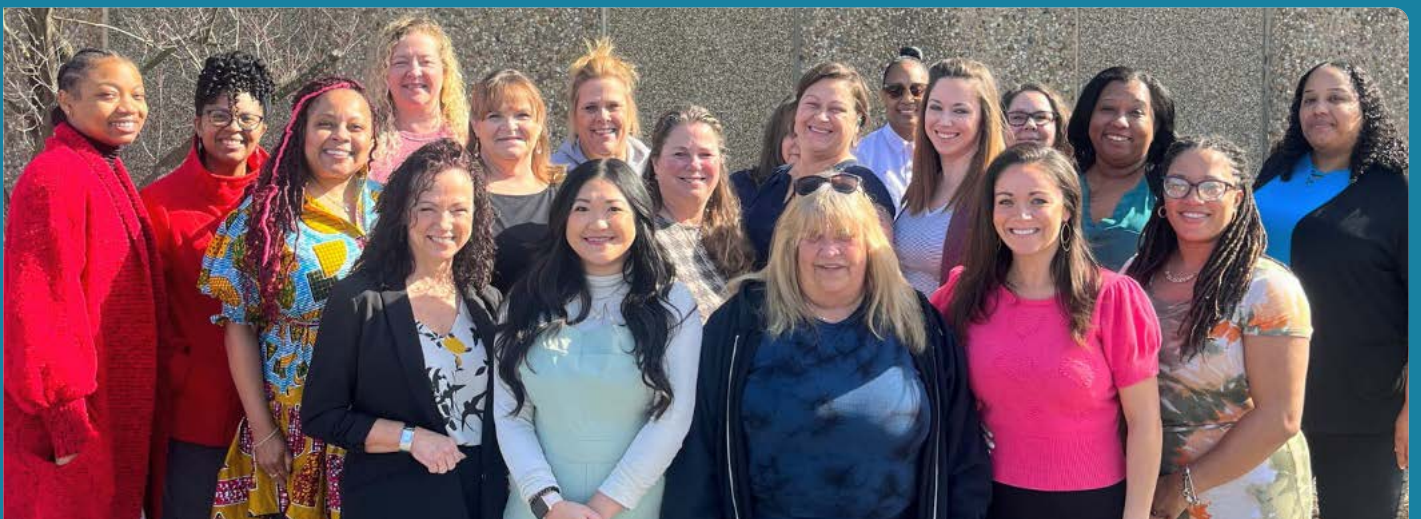
To the women of TFC Recycling, THANK YOU.