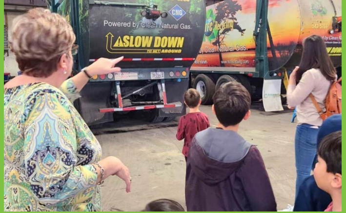
We Like Big Trucks! TFC provide a workshop and a tour of the trucks to homeschool students