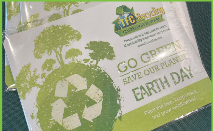
Planting Good, Sustainable Seeds! TFC provided sustainable giveaways for Earth Day events around in