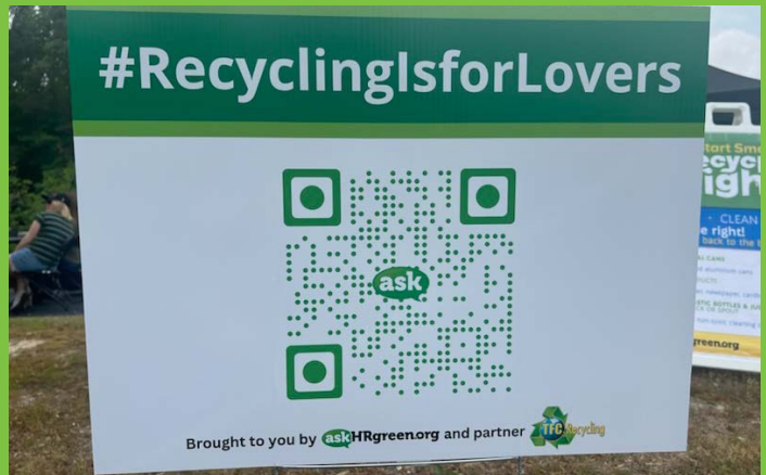
Share the Love! Scan the QR Code to learn more about the LOVE sign and its location in the region