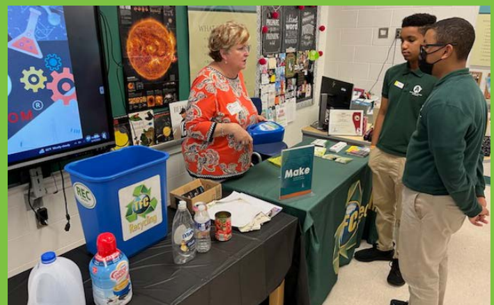
Green STEAM! TFC participated at the STEAM Fair for Achievable Dream Academy, Virginia Beach