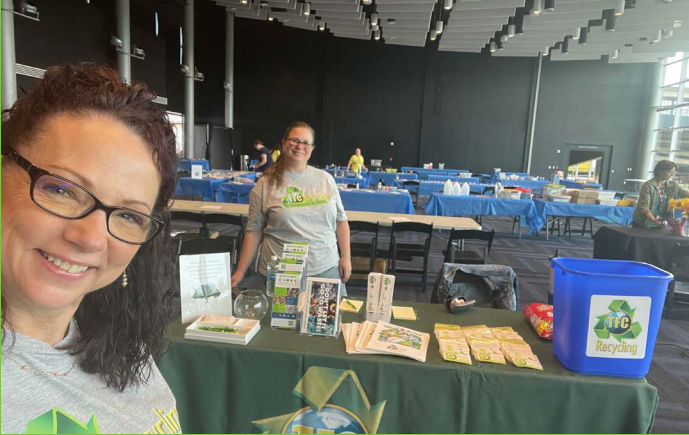
TFC Recycling was a featured vendor at Earth Day Events in Chester, VA

During Earth Day, our company came together as a united force to make a meaningful difference in our communities. Engaging in corporate volunteer activities throughout the region, we took action to protect and preserve our environment. With a shared commitment to sustainability and community engagement, we dedicated our time and efforts to create positive change, leaving a lasting impact on Earth Day and beyond.