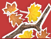
Yard Waste Leaves, Clippings, Debris