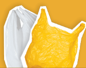
Plastic Bags Return to store